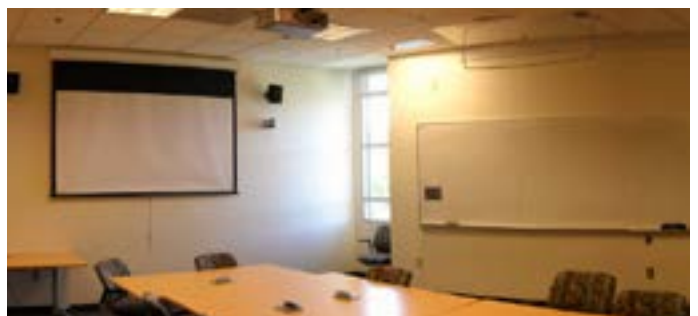
2208 - Seats 12