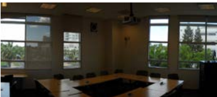
2207 - Seats 16