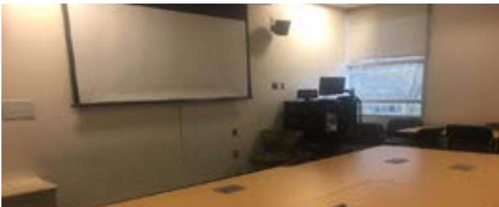
2213 - Seats 12