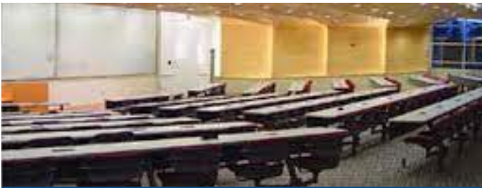
1222 - Seats 150