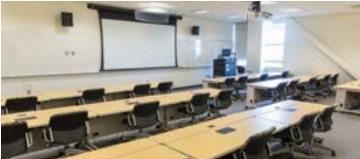
2206 - Seats 30