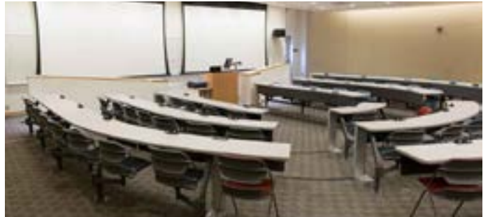
1204 - Seats 60