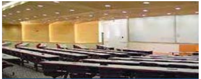
2222 - Seats 150