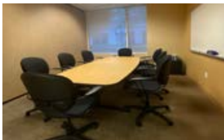
1509 - Seats 8