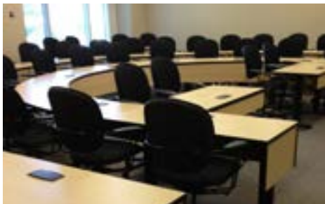
1501 - Seats 42