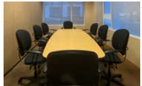
1510 - Seats 8