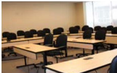
1502 - Seats 48