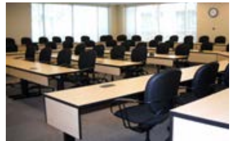
1503 - Seats 68