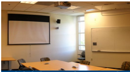
2208 Seats 12