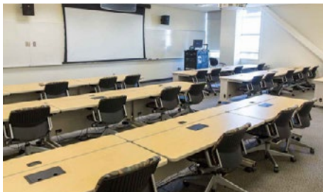
2205 Seats 30