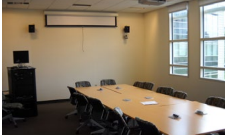
2204 Seats 16