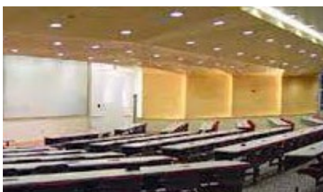
1222 Seats 150