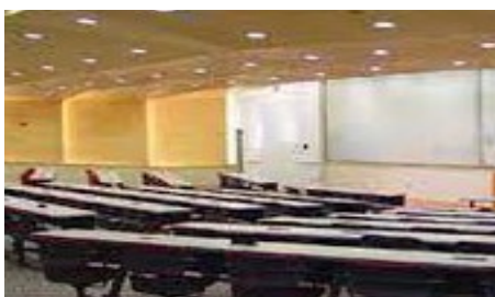
2222 Seats 150