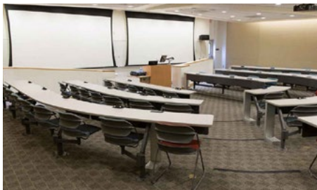
1204 Seats 60