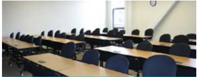
2310 - Seats 48