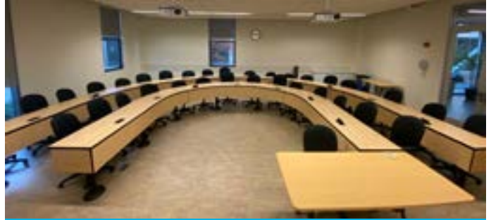
1302 - Seats 34