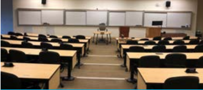
1213 - Seats 76