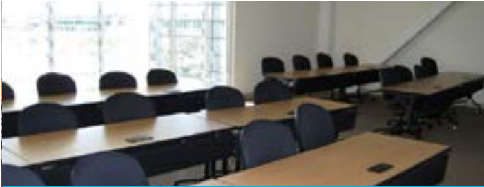
2102 - Seats 28